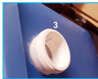
(3) Pool Wall Fitting

2. Slide in and Screw few threads of New Pool Cooler device having a header pipe in to the pool threaded adapter.