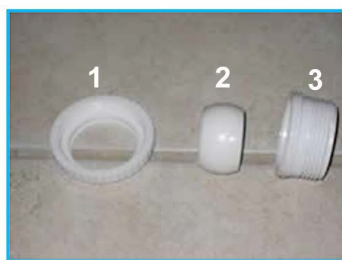
(1) Retainer Ring, (2) Eye Ball