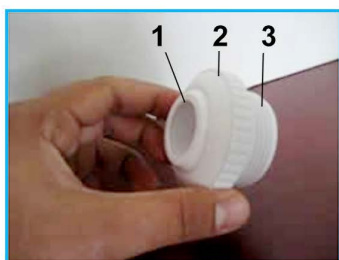
Pool Wall Adapter Assembly

1. Remove Two fittings out of three in your pool wall fittings (1) Retaining Ring, (2) Eye Ball and Keep this (3)rd Threaded Pool Wall Fitting adapter sticking on your pool wall currently in the return outlet.